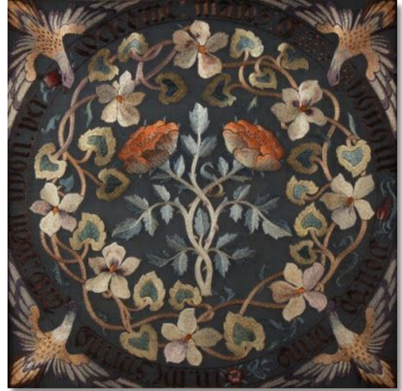
'Maids of Honours' c.1890